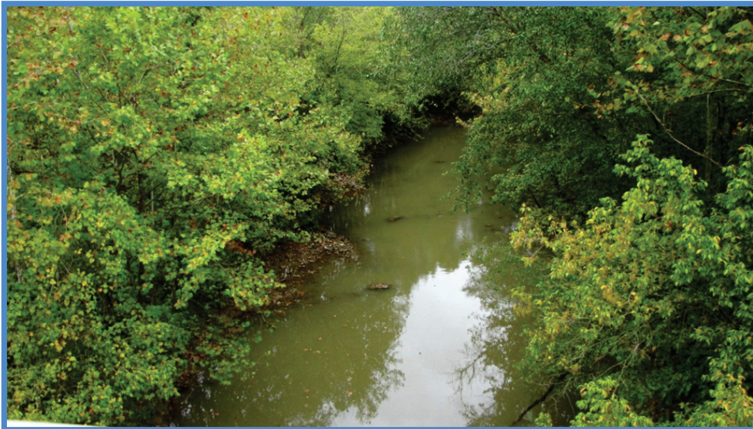
Paint Creek traverses the area