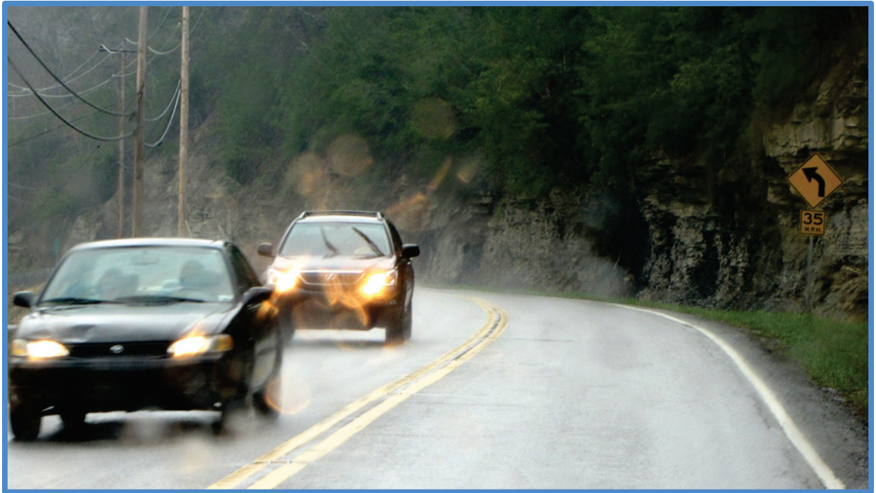
KY 40 Horizontal Curvature North of WH Dixon Road Intersection