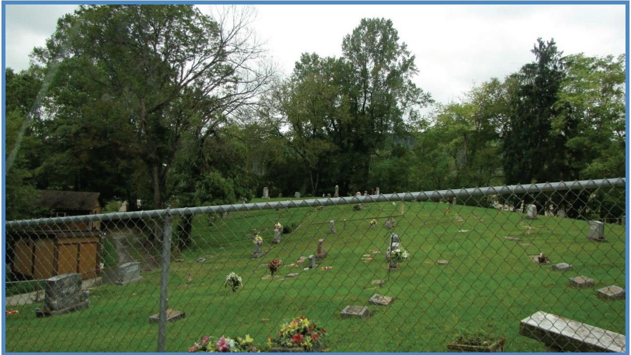
Cemetery very close to sharp “hospital curve” on KY 40 potentially historic