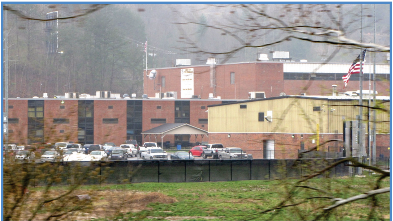
Johnson Central High School and Johnson County Middle School complex