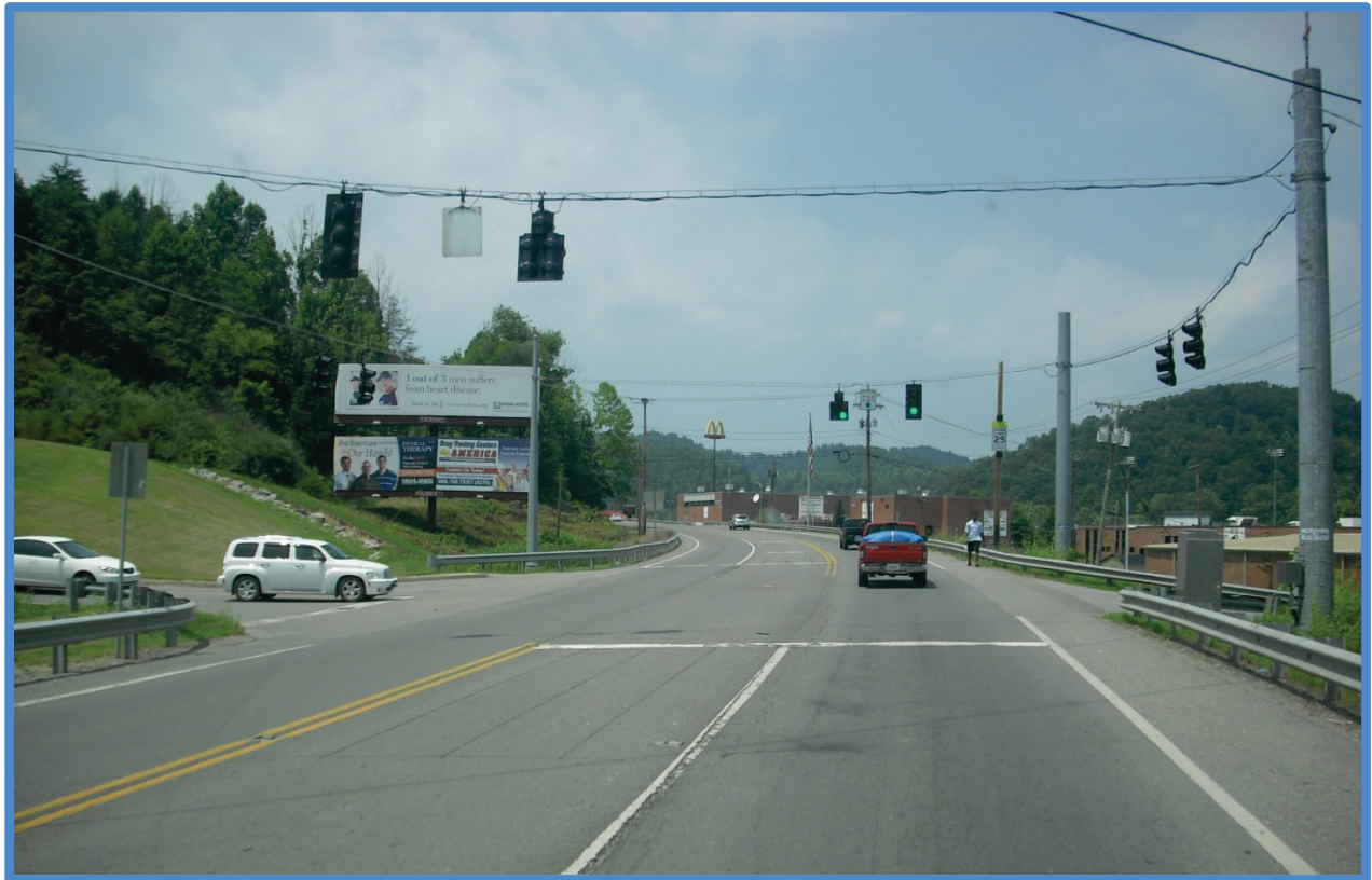
KY 321 headed north with pedestrian on shoulder of road