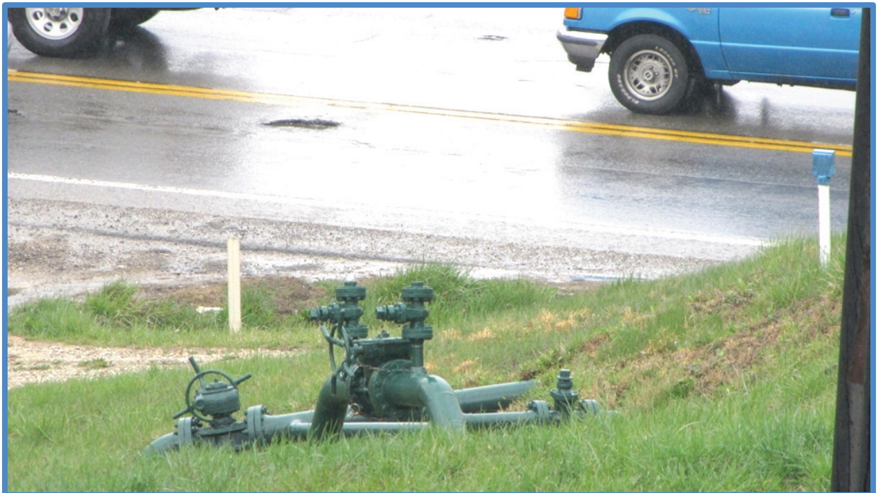
Major Gas Line just West of KY 321