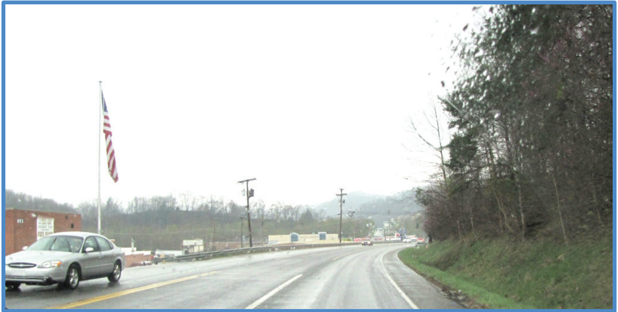
KY 321 Southbound in front of Schools