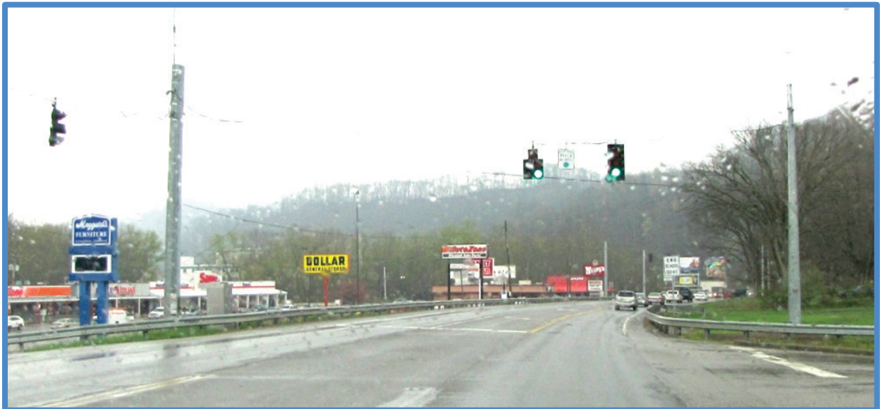
KY 321 Southbound in front of Post Office