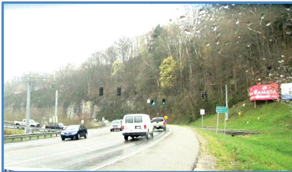
KY 321 Southbound at KY 2378 (James Trimble Boulevard)