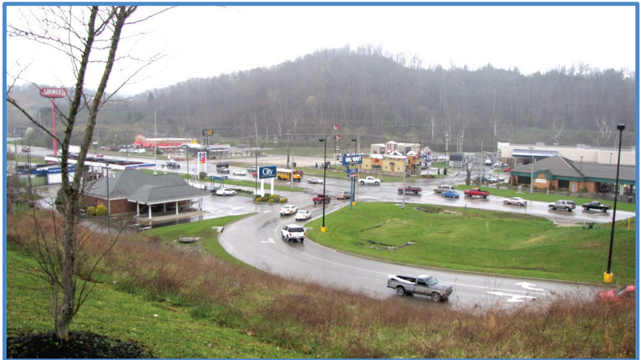
Walmart Entrance onto KY 321