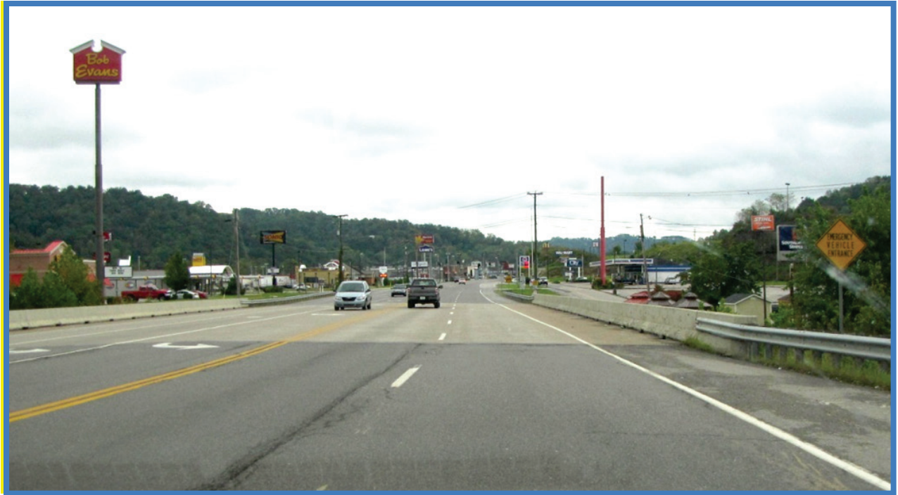
KY 321 Southbound Beginning Near KY 40