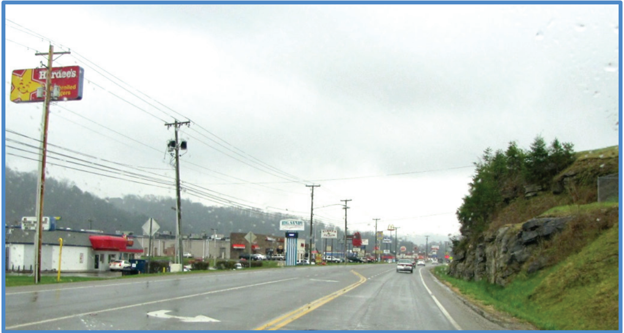
KY 321 Southbound South of Walmart Entrance