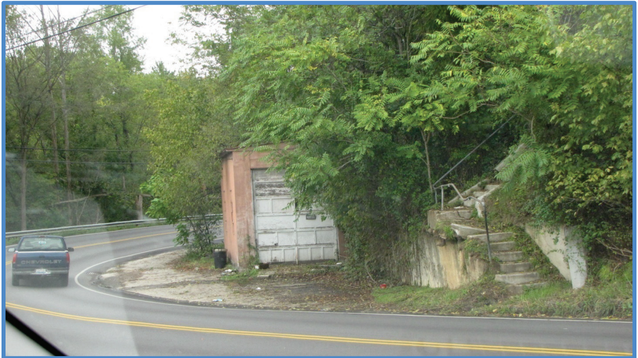
Extreme Horizontal Curvature on KY 40 near Paul Hall Hospital