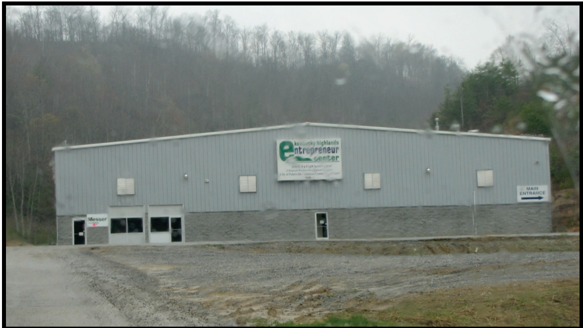
New Pharmacy School Site on Teays Branch Road