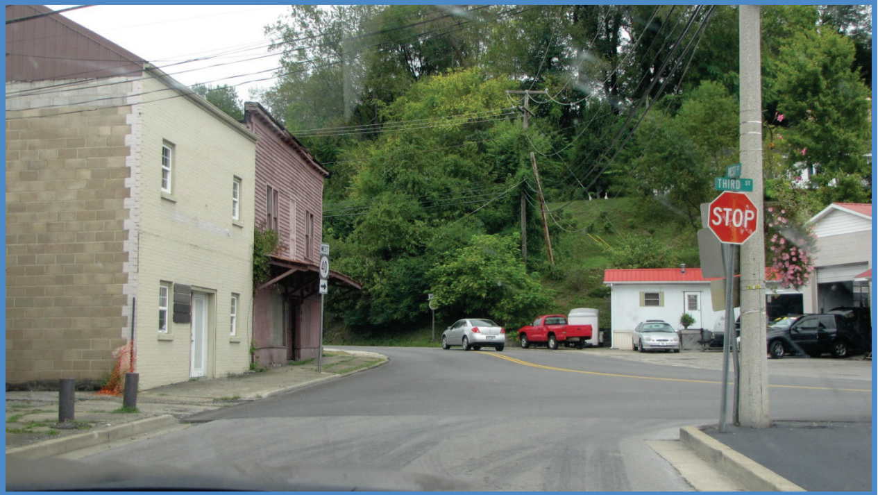
Blind curve at the South end of KY 40