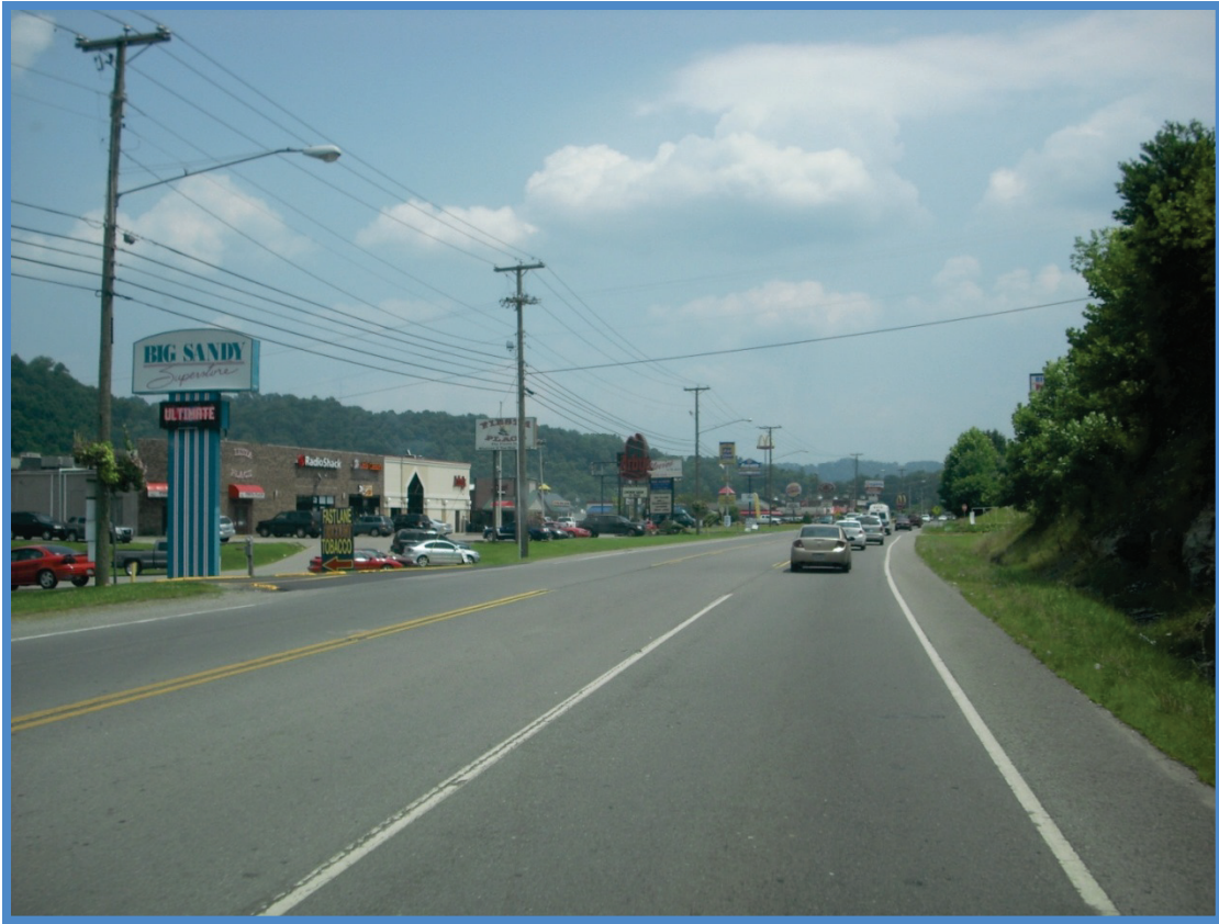
Dense development along KY 321 (headed southbound)