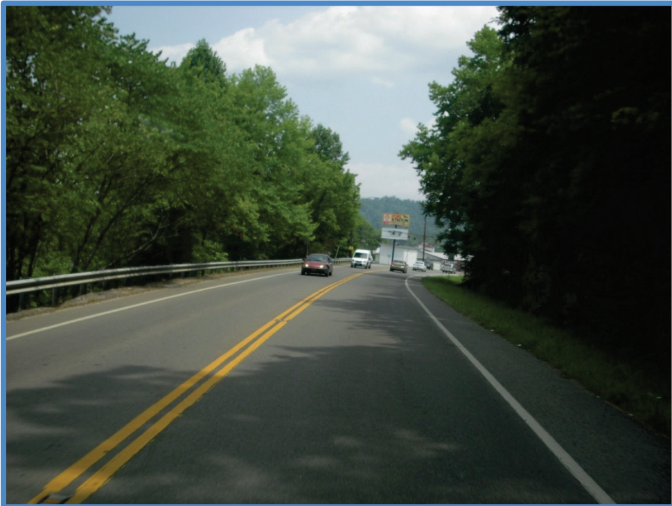
KY 321 Southbound approaching Mill Branch Road