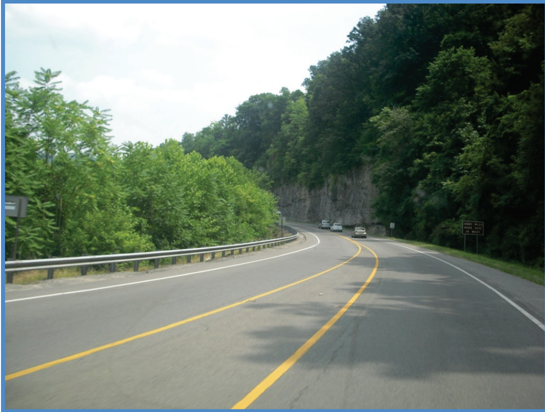
Steep cuts along the West side of KY 321 (southbound beyond KY 2378)