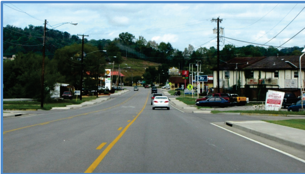
KY 321 South End of Project looking North