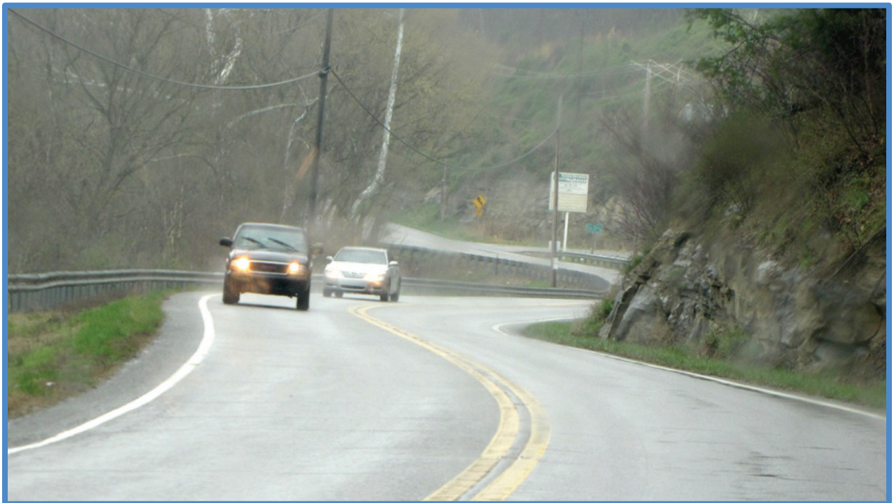
KY 40 Horizontal Curvature South of Teays Branch Road Intersection