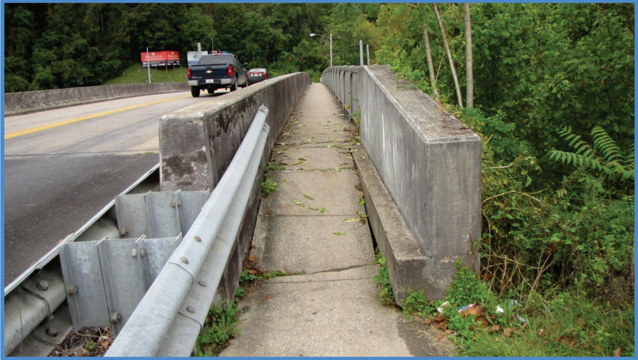
Sidewalk on KY 2378 vanishes on KY 321