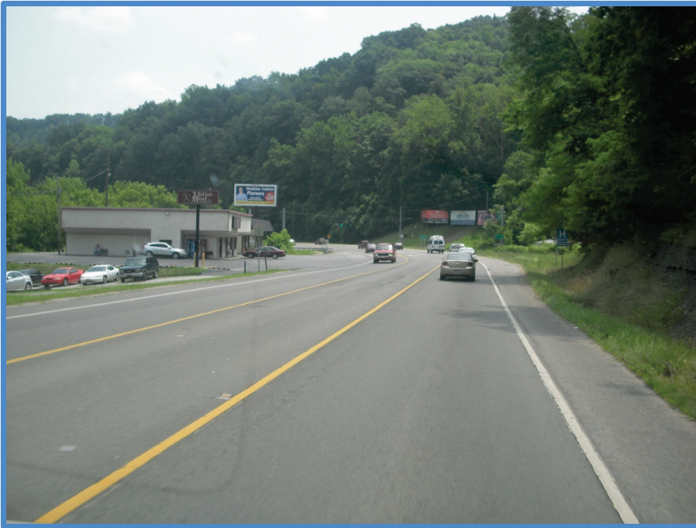
KY 321 Southbound near Pizza Hut