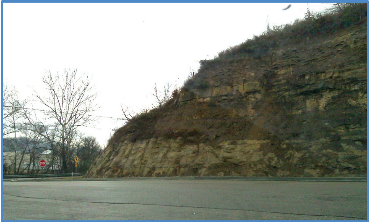
Teays Branch Road Embankment at KY 40 Intersection