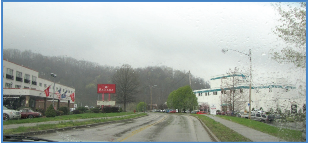
Paul Hall Hospital on the right – KY 2378 heading west