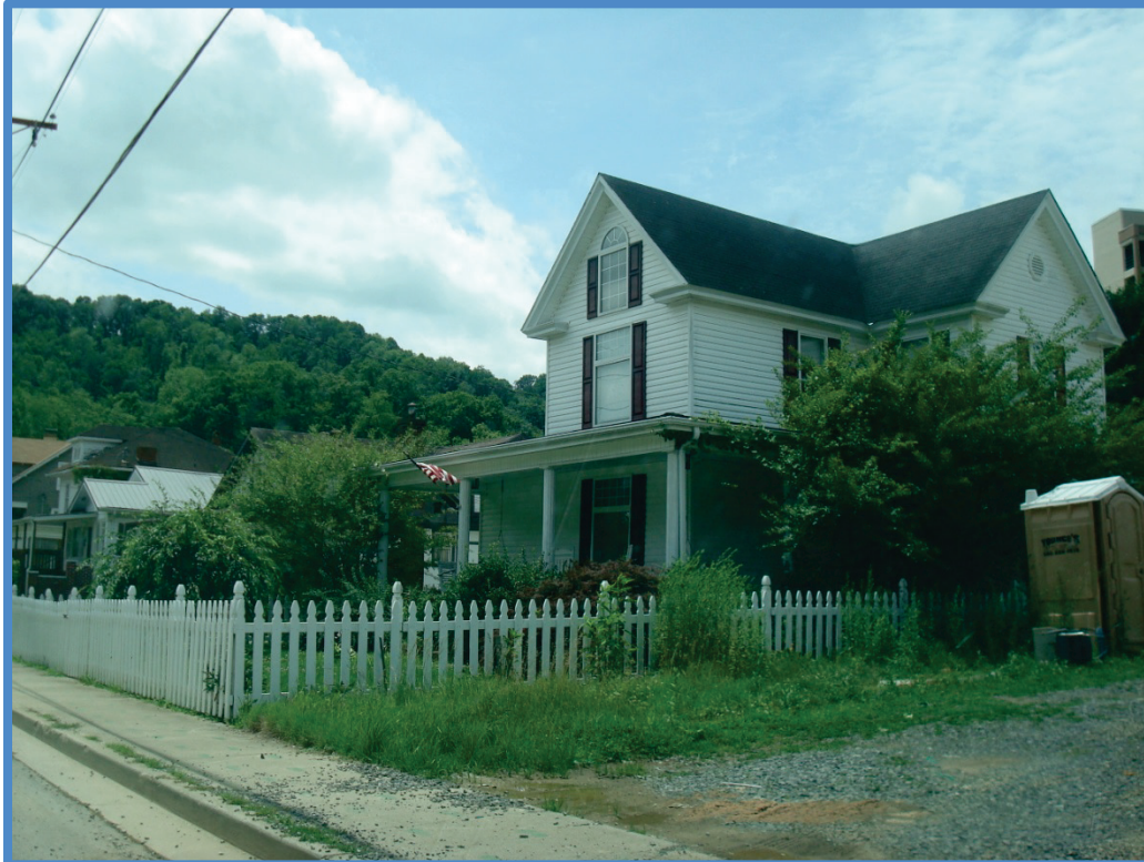
NRHP Property on West Street just off KY 40