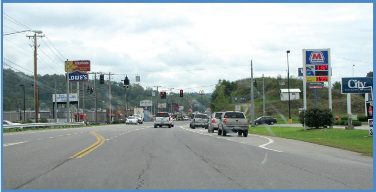
Southbound on KY 321 – Driver decisions include: right turn lane to go to Marathon station or continue on in the turn lane to Walmart, left turn lane and merge into one lane from two all at one point.