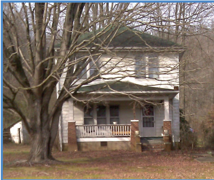
Beside the Post Office on the same side of KY 321 potentially eligible for the NRHP