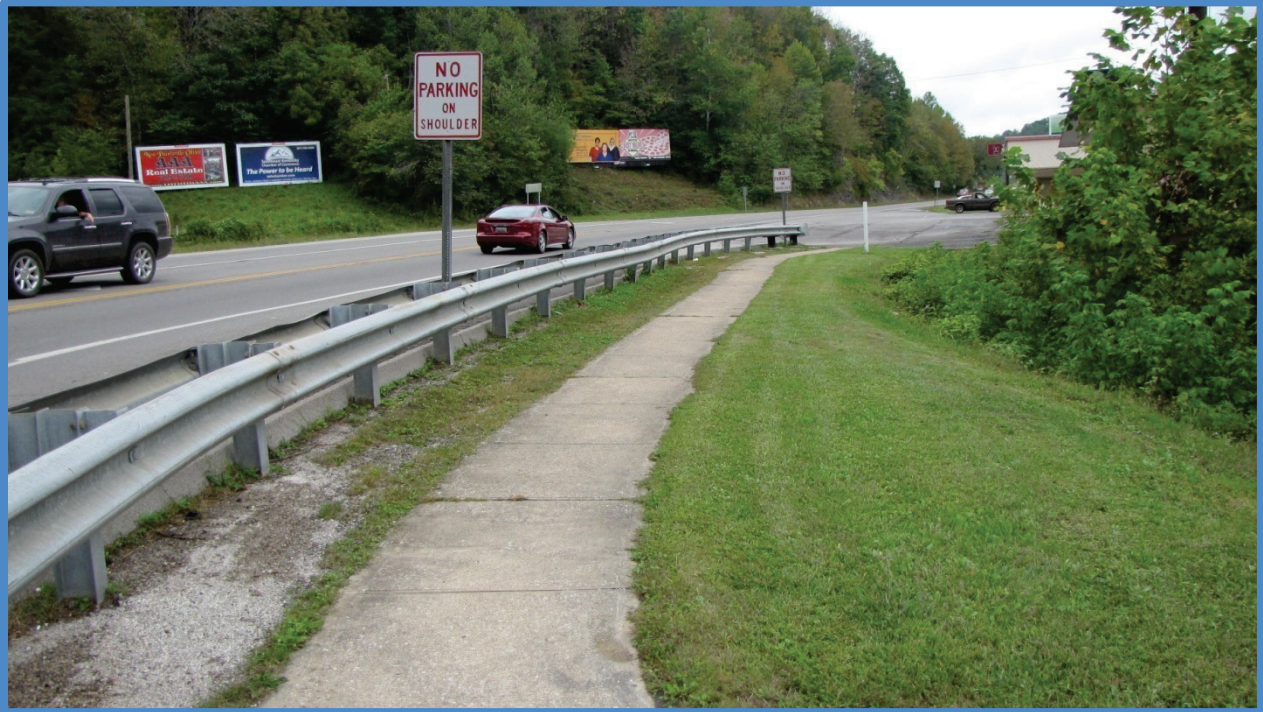
Sidewalk on KY 2378 at KY 321 Intersection